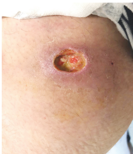
Figure 3. Skin wound on the left thigh.

overnight, then 1000 µg of LT4 was administered, and the oral cavity was inspected, and behavior was observed for 90 min. FT4 increased from 1.1 ng/dL (0.9-1.7 ng/dL) to 2.9 ng/dL in 4 h gradually (Figure 4). To confirm the diagnosis, rapid test was combined with a long LT4 absorption test. The patient was given 600 mcg of LT4 once a week for four weeks. After LT4 intake, the patient was kept under observation for 2 h. At the end of four weeks, the TSH level was 1 uIU/mL.