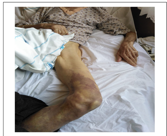
Figure 4. Appearance of the left lower extremity demonstrated cyanosis with distinct boundaries above knee level.

After self-isolation at home conditions for 5 days, the patient referred to the emergency department again with breathing difficulties, fever, cough along with cyanosis and loss of peripheral pulses on left lower extremity.(Figure 2) He has no spontan pain on left lower extremity. Radiology tests were repeated and the presence of peripherally located ground glass densities on both x-ray, and thorax CT showed advanced ground-glass opacities with extended peripherally located subpleural areas in both lungs, and are reported as typical for coronavirus infection. Also, an angio-CT was ordered to evaluate the peripheric circulation.