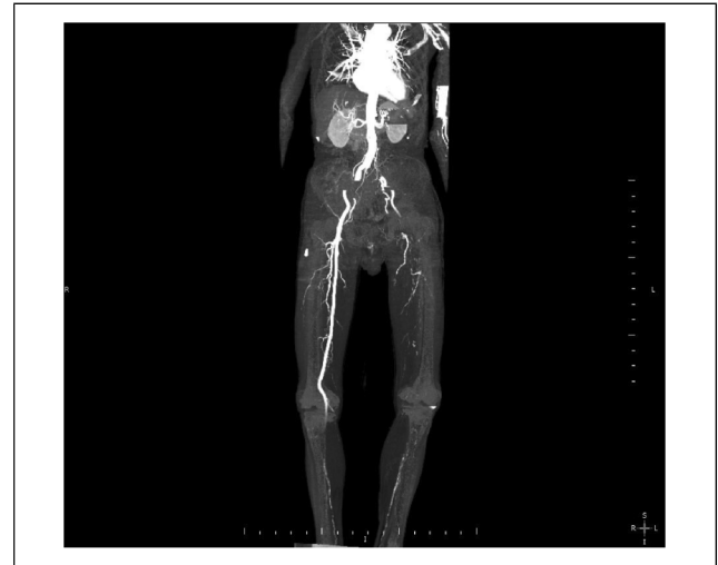
Figure 3. Angio-CT sections of the patient revealed no contrast filling was observed in the common femoral, superficial femoral, popliteal arteries and trifurcation in the left lower extremity.

After self-isolation at home conditions for 5 days, the patient referred to the emergency department again with breathing difficulties, fever, cough along with cyanosis and loss of peripheral pulses on left lower extremity.(Figure 2) He has no spontan pain on left lower extremity. Radiology tests were repeated and the presence of peripherally located ground glass densities on both x-ray, and thorax CT showed advanced ground-glass opacities with extended peripherally located subpleural areas in both lungs, and are reported as typical for coronavirus infection. Also, an angio-CT was ordered to evaluate the peripheric circulation.