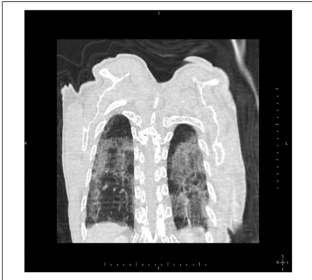
Figure 1. Thoracic CT scan imaging findings indicating COVID-19 pneumonia. Note the patchy ground-glass densities with extensive peripheral location in lower lobes of both lungs.

The CT imaging findings were evaluated by an experienced radiologist and reported as COVID-19 pneumonia.(Figure 1) Laboratory findings were also indicative (Crp: 54 mg/L, Wbc: 7400 uL, Lymphocyte: 1560 uL, D-Dimer: 730 ng/ml, Fibrinogen:425 mg/dl). A nasopharyngeal swab sample was sent for PCR analysis. Although the PCR test resulted negative, the patient was diagnosed as COVID-19 pneumonia treatment according to guidelines of the Ministry of Health was initiated. The patient was then discharged with COVID pneumonia treatment including oseltamivir, azithromycin, cefdinir and paracetamol.