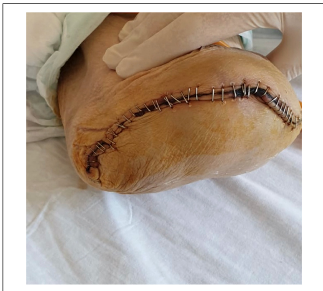
Figure 5. No wound complications were observed during inpatient follow-up period.

No contrast filling was observed in the common femoral, superficial femoral, popliteal arteries and trifurcation in the left lower extremity on contrasted lower extremity angio-CT. (Figure 3) The patient was admitted to the COVID ward and consulted with cardiovascular surgery (CVS) and orthopedics departments. Orthopedic physical examination revealed pain on left extremity above knee level. An asymmetrical appearance between legs was noticed, the left calf was colder when compared with the right side; and developed cyanosis with distinct boundaries (Figure 4). As the limb ischemic necrosis diagnosis was achieved, and no revascularization interventions were considered by CVS department, an above-knee amputation was planned. Because of the localization of necrosis in the affected extremity, cardiovascular surgeons did not plan thrombolectomy and thrombus aspiration.