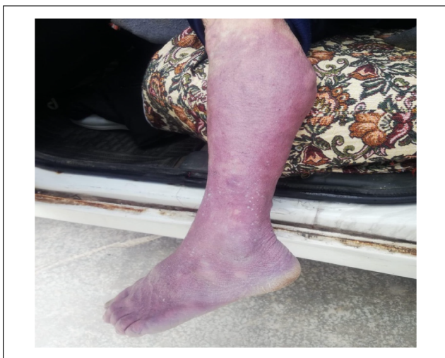
Figure 2. Appearance of the left lower extremity with cyanosis and loss of peripheral pulses at emergency department.

The CT imaging findings were evaluated by an experienced radiologist and reported as COVID-19 pneumonia.(Figure 1) Laboratory findings were also indicative (Crp: 54 mg/L, Wbc: 7400 uL, Lymphocyte: 1560 uL, D-Dimer: 730 ng/ml, Fibrinogen:425 mg/dl). A nasopharyngeal swab sample was sent for PCR analysis. Although the PCR test resulted negative, the patient was diagnosed as COVID-19 pneumonia treatment according to guidelines of the Ministry of Health was initiated. The patient was then discharged with COVID pneumonia treatment including oseltamivir, azithromycin, cefdinir and paracetamol.