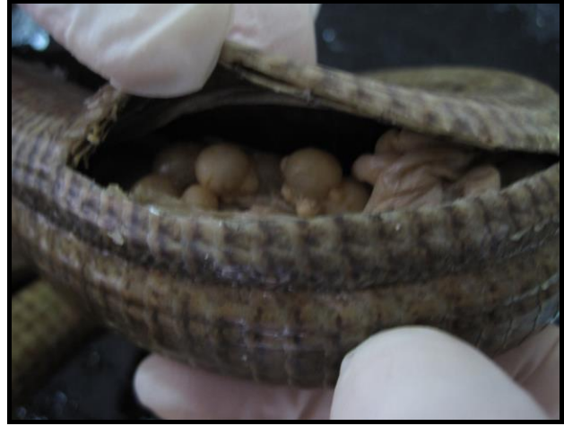
Figure 3. Eggs with miscellaneous dimensions in a dissected P. apodus .