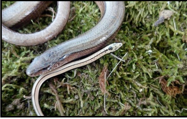
Figure 1. Anguis fragilis complex individual with a newborn.